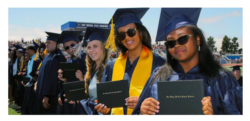
SDUSD grads.

A rigorous new "college prep" graduation requirement in the San Diego Unified School District looks likely to produce more college-eligible students but even more who will fail to graduate entirely, according to a report by the San Diego Education Research Alliance (SanDERA) at UC San Diego.